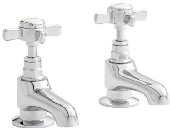
ILLUSTRATION: KLASSIQUE BASIN PILLAR TAPS