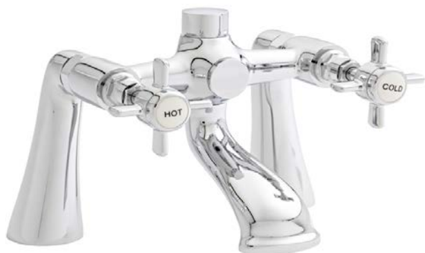
ILLUSTRATION: KLASSIQUE BATH FILLER