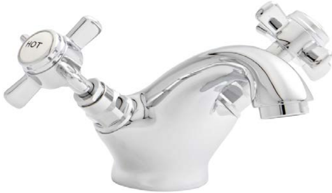
ILLUSTRATION: KLASSIQUE MONO BASIN MIXER