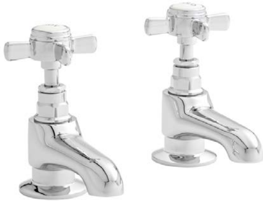
ILLUSTRATION: KLASSIQUE BATH PILLAR TAPS