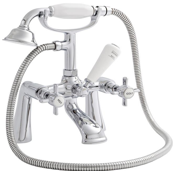
ILLUSTRATION: KLASSIQUE BATH SHOWER MIXER